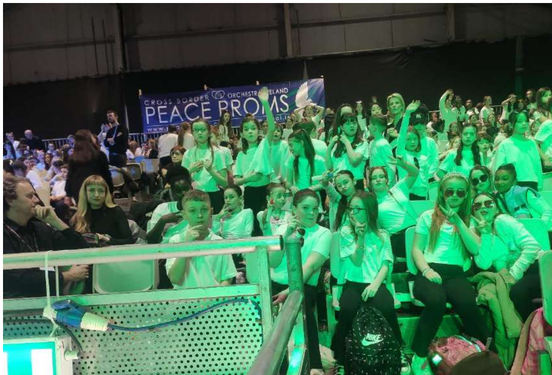
Fifth class pupils enjoying Peace Proms

There was one issue on the bus. A little bit after we got on the bus someone puked on the 2nd floor. When everyone was getting off the bus at the school the puke was still there. The rest of the trip was fun and enjoyable for everyone.