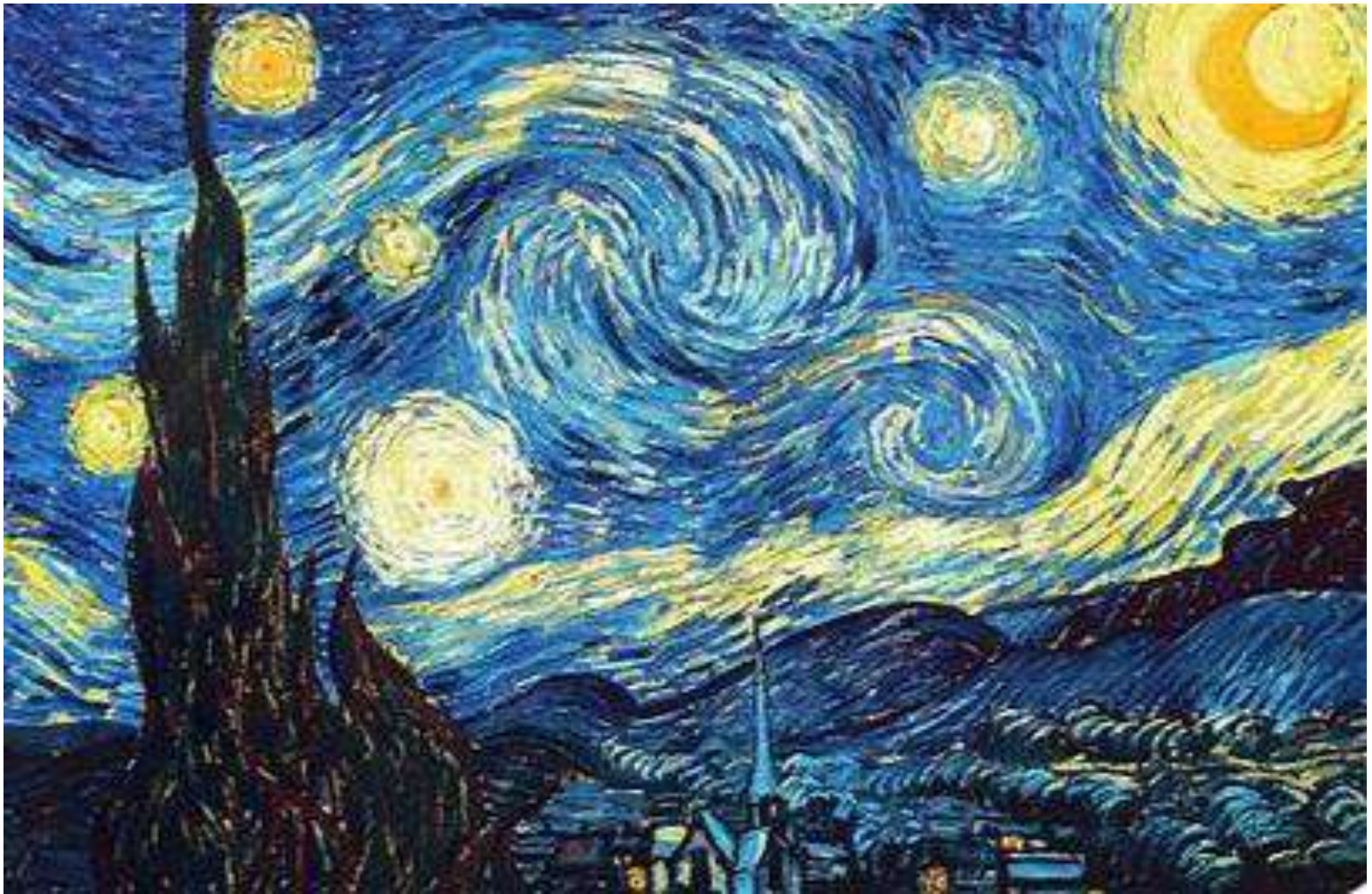
Starry Night by Vincent Van Gogh