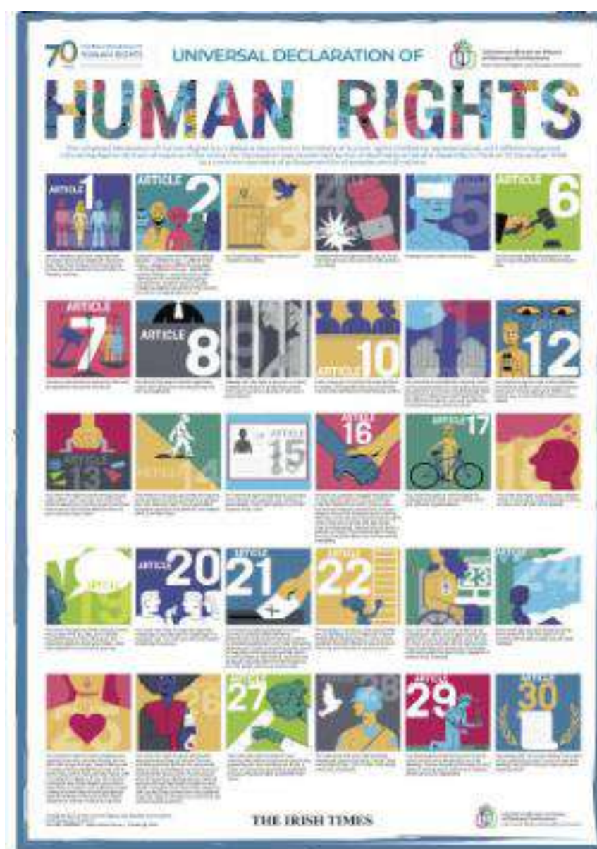
All 30 Human Rights